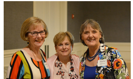
Photo from the Luncheon